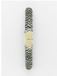
Lynda Benglis UNTITLED 1971 Wax and pigment on wood 36 1/4 x 5 1/2 x 2 1/2 inches 92.1 x 14 x 6.4 centimeters CR# BE.40084