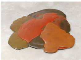
Lynda Benglis UNTITLED 1969 Pigmented polyurethane foam 7 x 50 x 59 inches 17.8 x 127 x 149.9 centimeters CR# BE.13917