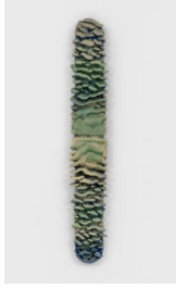
Lynda Benglis KAREN 1972 Wax on wood 36 x 5 x 3 inches 91.4 x 12.7 x 7.6 centimeters Signed on verso: Lynda Benglis Karen 1972. CR# BE.5178