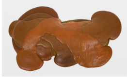
Lynda Benglis NIGHT SHERBET B 1968 Pigmented polyurethane foam 6 5/16 x 36 1/4 x 18 7/8 inches 16 x 9179.6 x 47.9 centimeters not signed CR# BE.7696