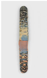
Lynda Benglis UNTITLED 1970 Pigmented beeswax, damar resin and gesso on masonite 36 x 5 x 3 inches 91.4 x 12.7 x 7.6 centimeters Signed and dated on verso: Linda Benglis, 68-70. CR# BE.16142